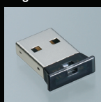
USB Bluetooth® adapter included