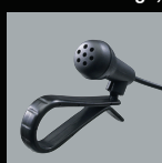
Wired MIC included